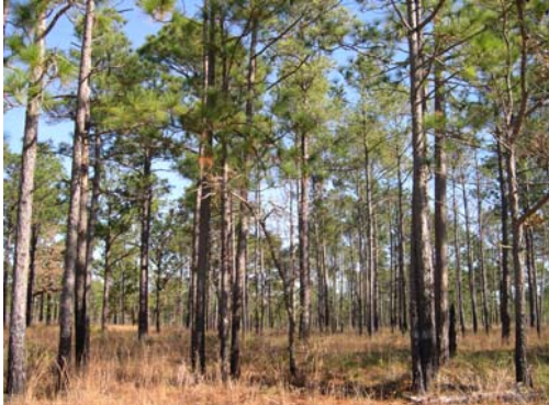
SERPPAS focuses on preserving the longleaf pine ecosystem.

Rapid population growth in the Southeastern United States is resulting in increasing urban sprawl. The conversion of land into developed communities has resulted in the loss of agricultural land, critical wildlife habitats, and working landscapes such as farms, forests, and fisheries. Sprawl has also increased encroachment on military installations, which hinders the military's ability to train effectively.