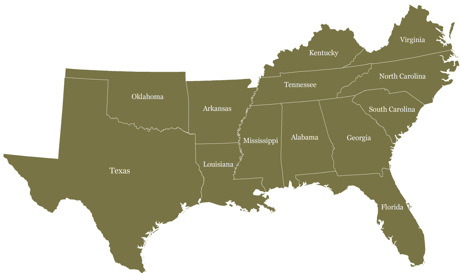
Figure 1. The 13-state region (Southern Region) considered in the review of prescribed fire statutes and cases.