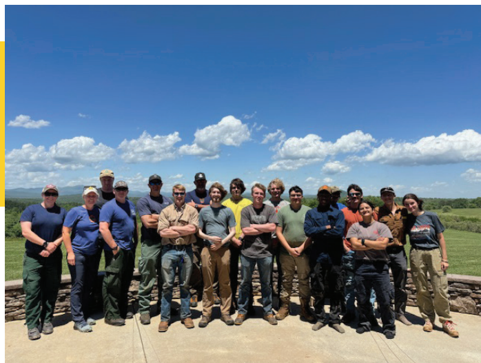
The Fire Tigers during S-130/190.

The Fire Tigers is a student burn crew composed primarily of FRNR students at Clemson University. Clemson University collaborates with the USFS to provide students with hands-on wildland fire experience and adhere to the same guidelines, certifications, and organizational systems used by professional fire fighters. Through this partnership, Fire Tigers assist the USFS with prescribed burns and wildfire response in the Andrew Pickens Ranger District of the Sumter National Forest in South Carolina. Note that the 17,500-acre Clemson Experimental Forest is managed with prescribed fire by the Forest Assets Crew. Fire Tigers may volunteer on prescribed burns, but the Forest Assets Crew is separate from the Fire Tigers program affiliated with the USFS.