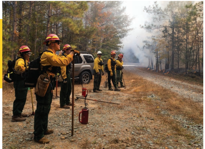
On the fireline at Goodwin Forest.

Scheduling. The Fire Pack is coordinated by NCSU Extension Forestry staff. When burn opportunities arise, they touch base with the FFT2-qualified students to see who is available, usually with a few days advance notice, when possible. Burns occur during weekdays, and students are expected to be responsible for their own scheduling integrity, as well as checking out their own PPE from the equipment room. A burn typically proceeds regardless of the number of students in attendance as there are often enough resources available within Forest Assets and Extension Forestry.