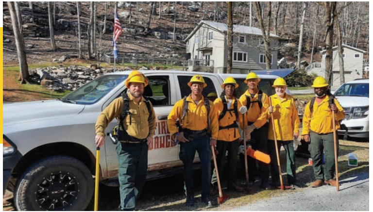
FireDawgs with their engine.

The Alabama A&M (AAMU) FireDawgs program was established in 2009 to prepare students for careers in wildfire management. Student burn crew members primarily consist of forestry majors. As the only historically Black college and university (HBCU) with an accredited forestry program, AAMU leads efforts to promote diversity in forestry and wildland fire careers. The FireDawgs primarily conduct prescribed burns for local private landowners, but have also historically supported the Alabama Forestry Commission in wildfire response. Additionally, prescribed burns are regularly conducted on AAMU's 972-acre Winfred Thomas Agricultural Research Station.