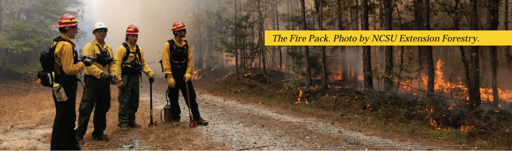
The Fire Pack.