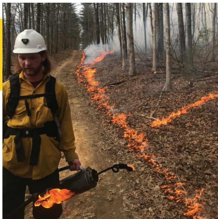
Carrying the torch.

The University of the South, commonly known as Sewanee, began using prescribed fire as a management tool on university-owned lands in 2010, with student involvement integral from the start. In 2015, the university expanded its program by offering wildland firefighter training and credentials to students interested in supporting prescribed burns. As of 2024, more than 500 students have earned their FFT2 certification and participated in prescribed fire activities on Sewanee's 10,000+ acres of forestland. Participants come from a wide range of academic disciplines—not only FRNR but also fields like history and philosophy.