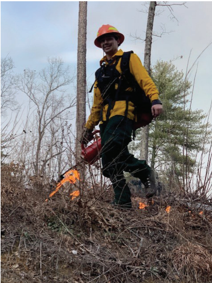
Clemson Fire Tigers student.

that takes their “forestry summer camp” will come out with their FFT2 qualifications met. However, some student burn crew programs do not require full FFT2 certification or the fitness test, particularly when burns are conducted on private land or when students are paired with “burn mentors” that possess full qualifications.