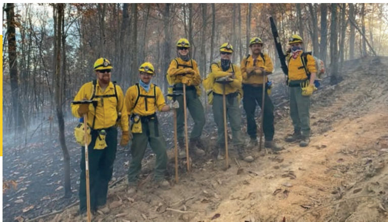
Fire Cats on the job.

The UK Fire Cats program is a collaborative effort between the University of Kentucky's Department of Forestry and Natural Resources, the Kentucky Division of Forestry (KDF) and USFS. Its primary goal is to provide UK Forestry majors with hands-on wildland firefighting experience. Participation in the Fire Cats program is competitive. Each fall semester, students must apply for one of the 21 available positions. Eligibility requires full-time enrollment at the university and good academic standing, with a cumulative GPA of 2.0 or higher. The program focuses heavily on training, and preparing the students for careers in forestry and fire management. Even if there is not an active fire, the Fire Cats are involved in extra training such as chainsaw safety or equipment maintenance.