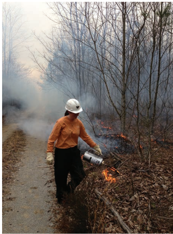
Sewanee Prescribed Fire Team student conducting a prescribed burn.

Many universities also require students to maintain this certification. For certification to be official, NWCG-certified instructors must teach the courses and lead the field day. Often, schools partner with local or regional fire agencies or non-government organizations to deliver the classroom training and instruct the field day. For example, NCSU partners with The Nature Conservancy (NC) the NC Forest Service, and NC State Parks to conduct training, and incorporates it into their summer courses for sophomore FRNR students. Each student