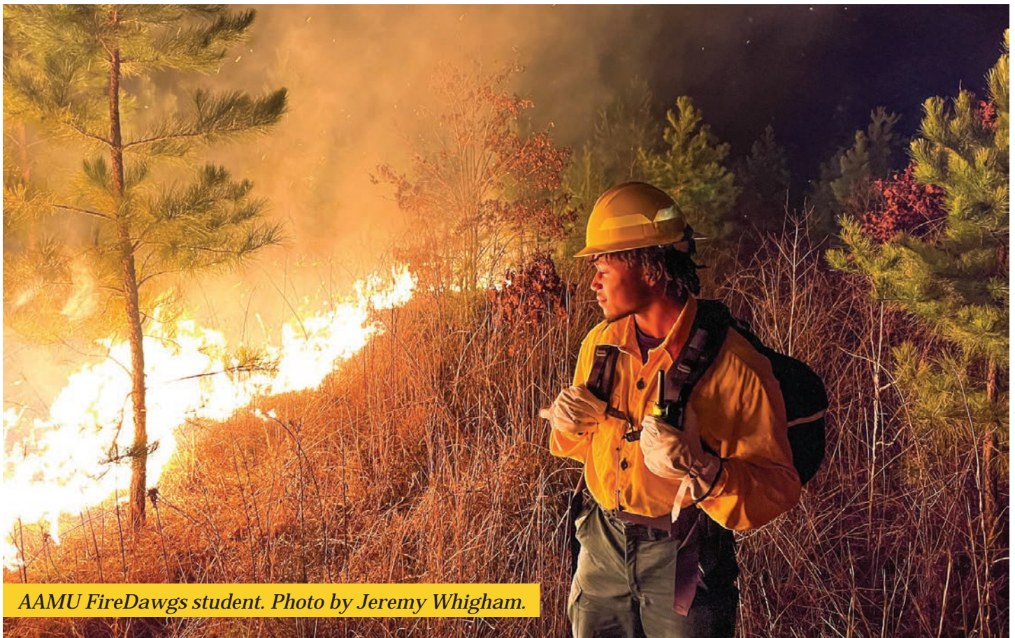
AAMU FireDawgs student.

NCSU’s efforts to develop its student burn crew program align with national priorities to address workforce shortages in wildland fire management. By incorporating hands-on training into their programs, colleges and universities can prepare students for careers in fire management while helping to meet the growing demand for skilled practitioners. This report explores the feasibility of establishing student burn crew programs, addressing key considerations such as training requirements, liability concerns, funding opportunities, and scheduling challenges.