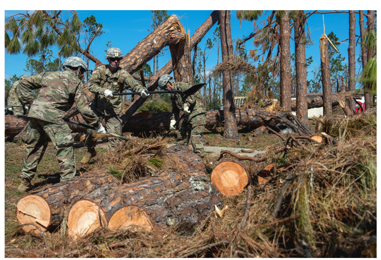
U.S. Army soldiers from the 46th Engineer Battalion move tree debris into piles to be pick up Oct. 31, 2018, on Tyndall Air Force Base, Florida. After Hurricane Michael swept the area, multiple major commands have mobilized relief assets in an effort to restore operations after the hurricane caused catastrophic damage to the base.

This broad overview was followed by a presentation that provided specific examples of Navy mission impacts, resiliency priorities, and challenges from climate change, including energy, infrastructure, and roads. Lt was emphasized that Navy Southeast is aviation-based and that the Southeast is also the primary training location for operational units. While the region is aviation-focused, access to "blue water training" is necessary: they must train 300-350 ships, which requires ports, infrastructure, facilities, and ranges, making partnerships with communities a priority. As severe weather events have increased in the Southeast over the last few years, primary concerns include hurricanes, storm surges, erosion, and extreme tides. Actions being taken or considered to address these concerns include: requiring that Inspector General reports evaluate port facility resiliency and sustainability; requiring that Integrated Natural Resource Plans (INRMP's) incorporate resilience/ sustainability concepts in plans and associated projects; and regional and local partnerships to increase resiliency.