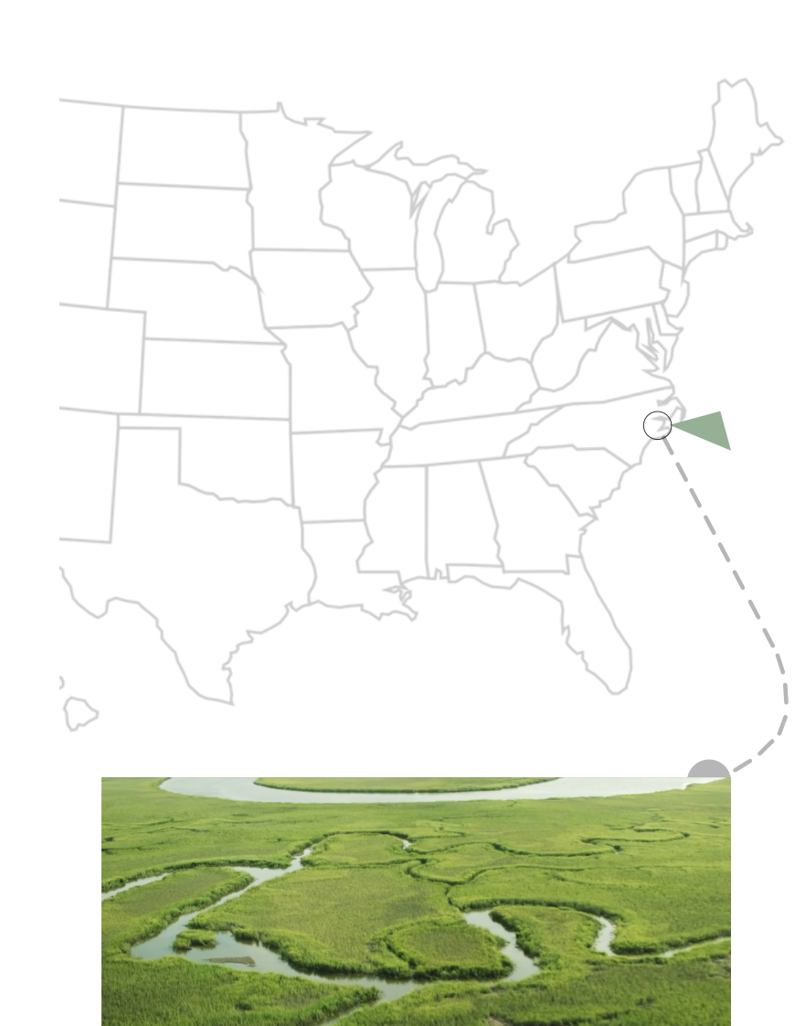
SALT MARSHES AT MARINE CORPS BASE CAMP LEJEUNE

As SERPPAS continues its coastal resilience work, recommendations included designing a letter/ questionnaire to be sent to coastal installation commanders to determine where they think there is risk, and seeking input from military services on baseline conditions and most significant risks to the natural and built environment that threaten mission sustainment at bases and ranges in the SERPPAS region, with emphasis on those in coastal areas. Finally, in regards to expertise, there is a gap between the academic community and end users who can implement the science. Additional tools for the end users can help to bridge that gap.