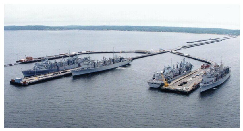
NAVAL WEAPONS STATION (NWS) EARLE