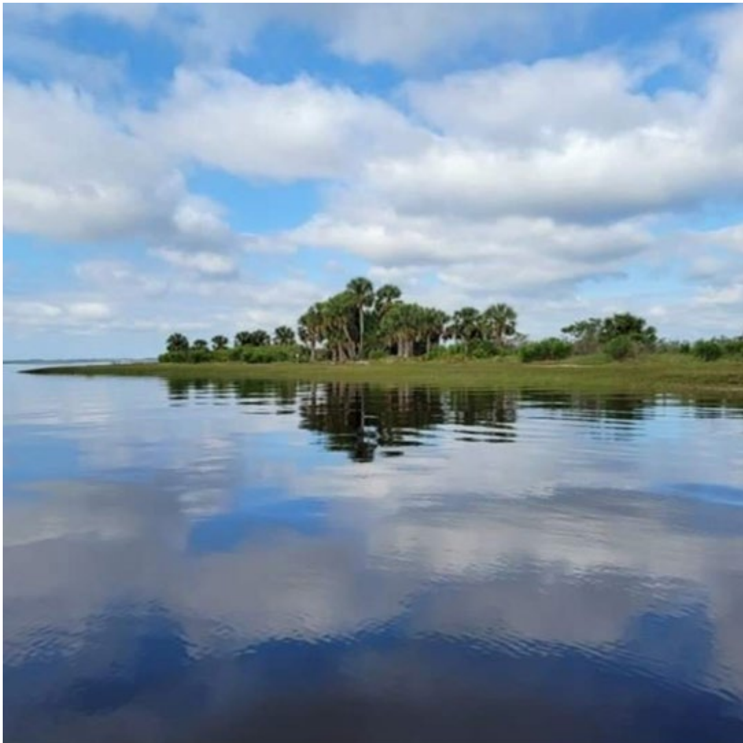
Smith's Island